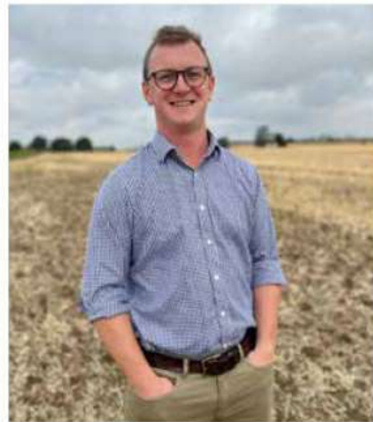
According to Andrew Cromie, graphite is often used in the USA as a dry lubricant within precision systems but Unium realised its wider potential.

“From experience, we know that early planting of a cover crop can be less favourable in terms of establishment, but if successful, can provide more time for the plants to flower and is therefore more likely to meet the aims of SFI actions. By using a biostimulant, we hope we can