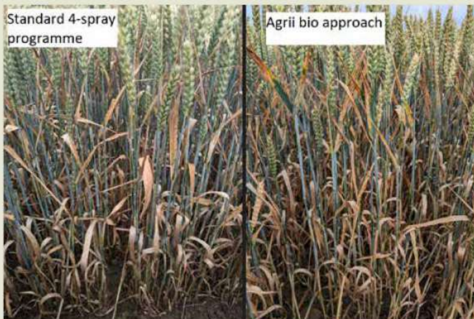
Integrating biosolutions within reduced fungicide programmes can produce the same results as full strength conventional treatments, suggests the trial. Left: Agrii standard 4-spray fungicide programme. Right: Agrii bio approach T0 and T1 followed by Agrii standard fungicides at T2 and T3.

Growth promoting compounds such as PGA (pyroglutamic acid) and phosphite have also impressed. “These enhance nutrient utilisation and efficiency, which improves rooting as well as upregulating photosynthesis