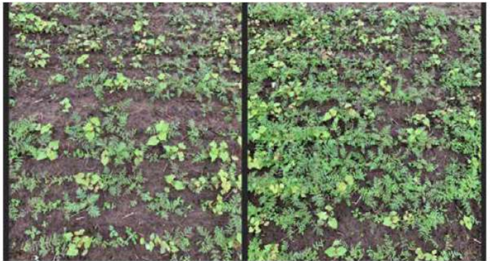
In the trial there was a measurable difference in the April-drilled Elios-GT-treated plots (shown right) from cotyledon stage through until stem extension.

overcome this challenge and improve biomass and ground cover," she says.