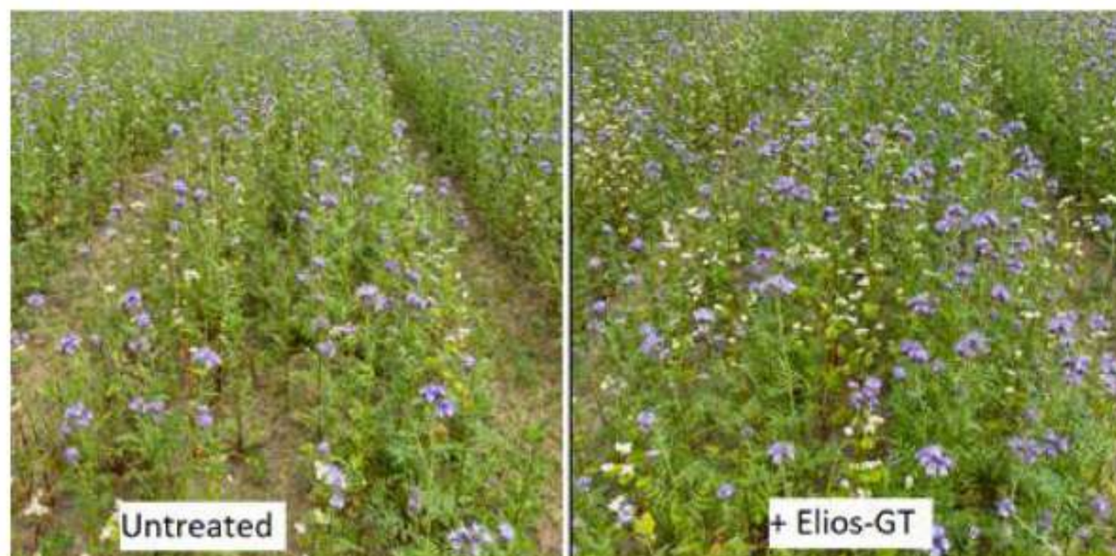
Anecdotally speaking, with Elios-GT (shown right) there appeared to be more flowers which would offer more to pollinators.

break crop, not cutting corners with establishment method, and using other tools to ensure good survival and rapid growth when conditions are sub-optimal."